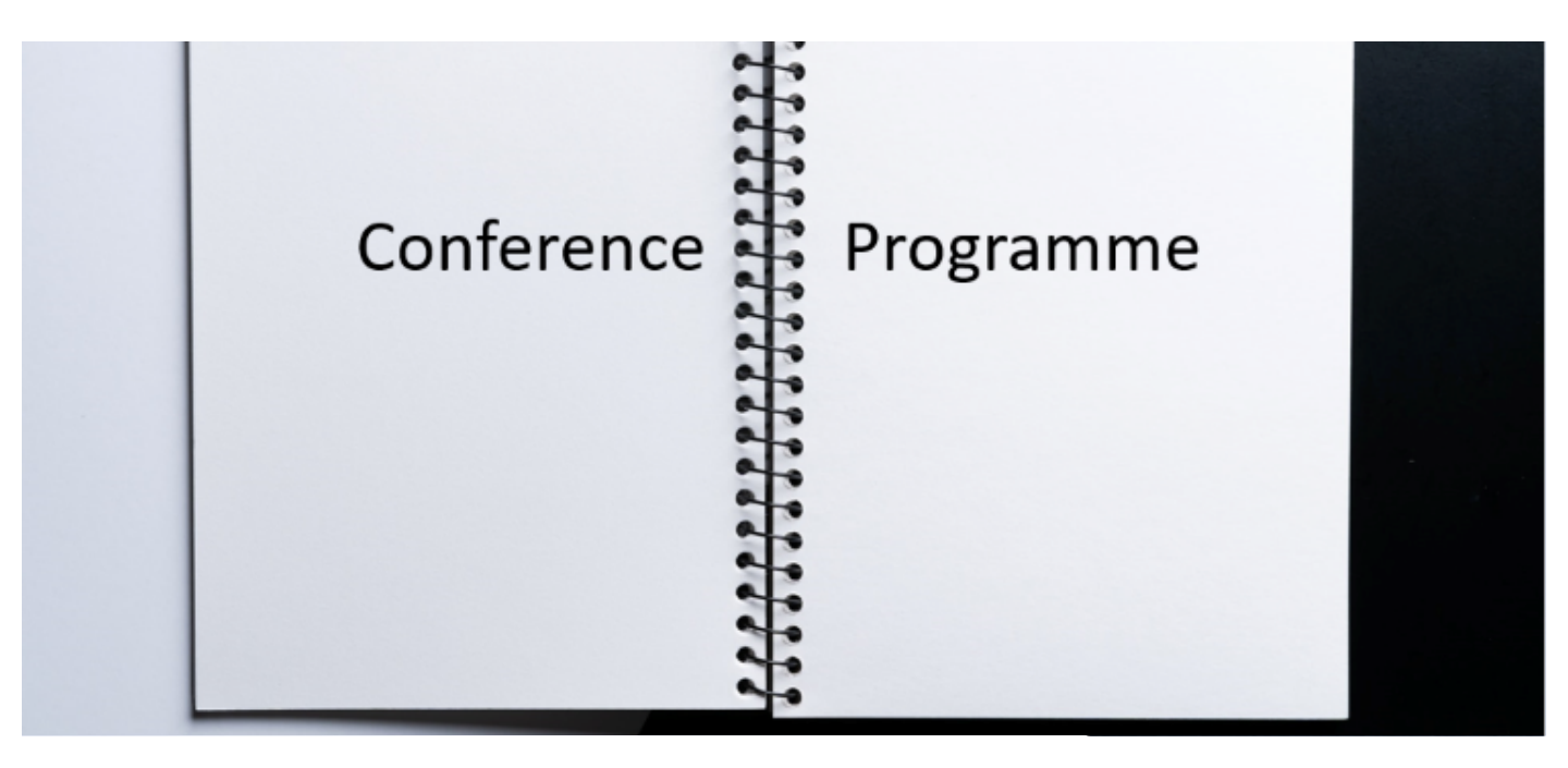
Conference Programme View here